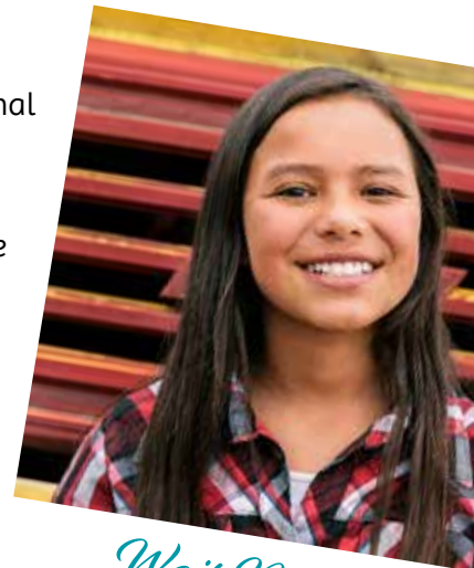
Wait No More

Whether a person or family is looking to provide a safe and loving home for a season, adopt for a lifetime or help support a resource family that does, this event will empower and educate the decision to get involved. For more information, visit www.waitnomore.org/CA .